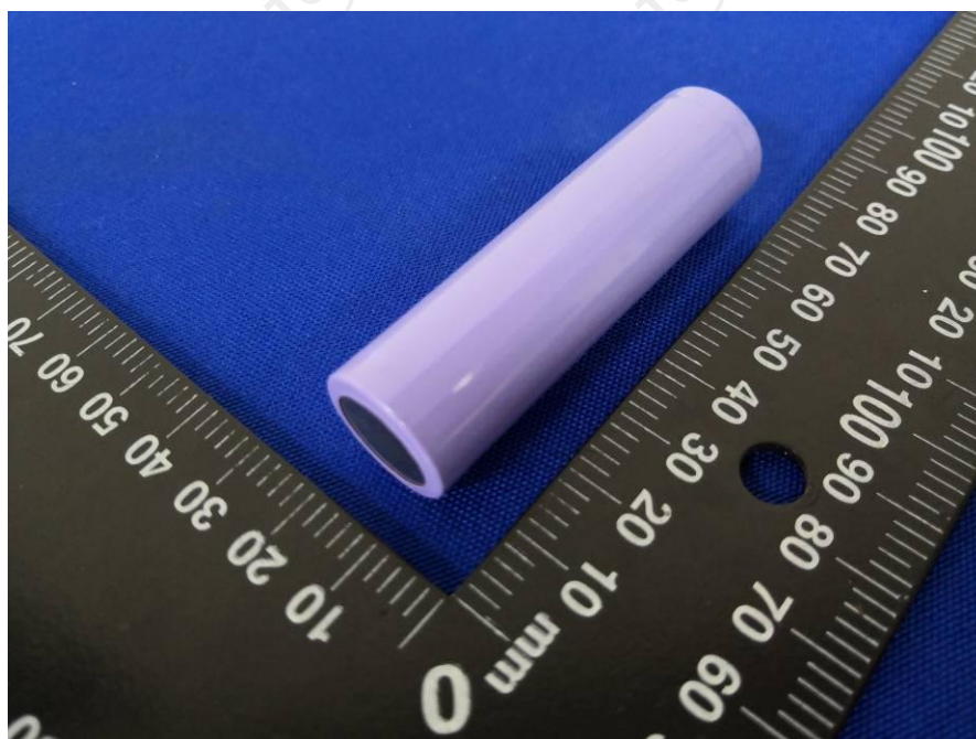
Picture 2. Cell view